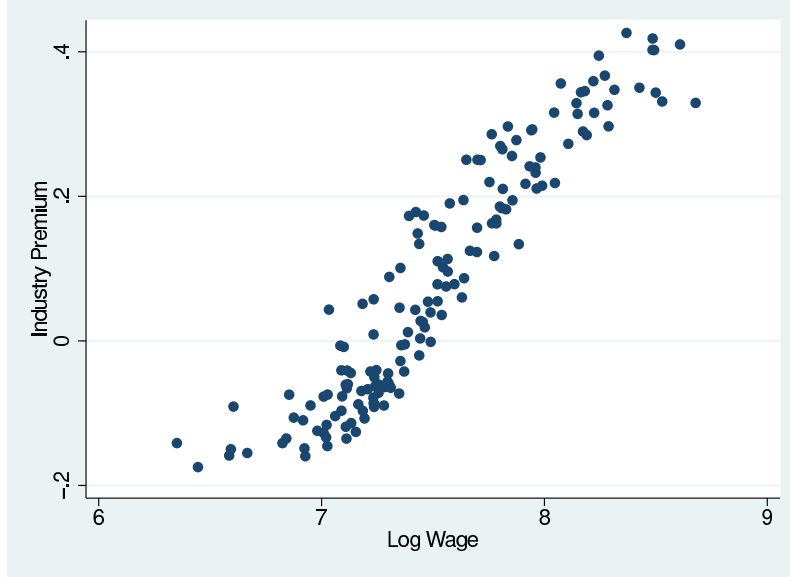
Figure 2: Average Log Wages and Occupational Premium

Notes: The figure plots the average log wage of workers in education/experience cells against the estimated occupational premium. See text for details. Sources: FQP, LFS, and Census data 1962-1999.